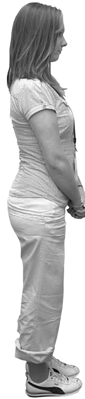
Good posture without heels