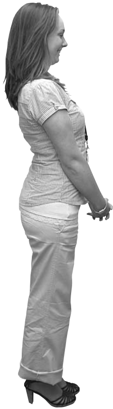
Poor posture with heels